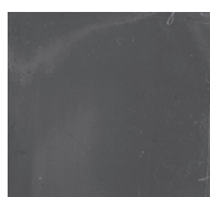
Clorox Healthcare® Hydrogen Peroxide Wipes