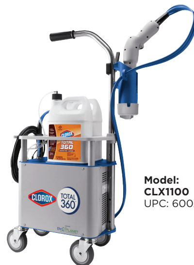
Model: CLX1100 UPC: 60025