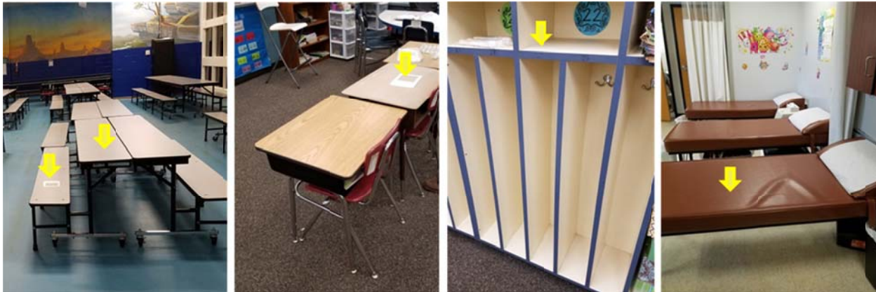
Figure 1. Surfaces in classrooms, a nurse's station, the cafeteria, a shared kitchen and a physical therapy room were swabbed to quantify bacteria, yeast and mold levels before disinfection, following manual disinfection, and again following the use of the Clorox® Total 360® System. Examples of sites swabbed are indicated with yellow arrows.

Five high touch surfaces per room were swabbed, including chairs, desks, door handles, soap dispensers, toilet seats, water fountains, light switches and other commonly touched objects present in the rooms (Figure 1). Levels of viable bacteria, yeast and mold, were quantified using standard microbiological techniques and are reported here as colony forming units (CFUs). Statistical analysis was performed on all data using Minitab® 18.1.