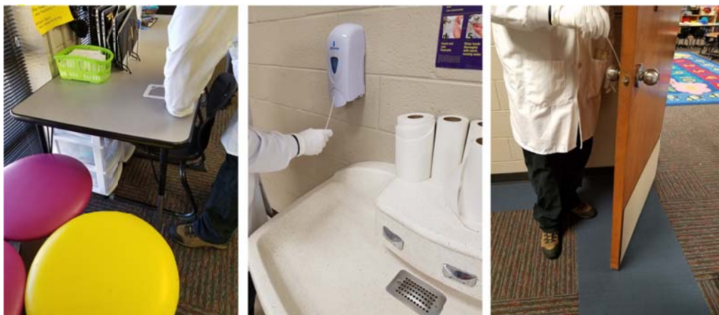
Figure 1. Surfaces in classrooms, a nurse's station, the cafeteria, hallways, and restrooms were swabbed to quantify bacteria, yeast and mold levels before and after sanitization and disinfection with the Clorox® Total 360® System. Examples of sites swabbed are shown above.

The goal of this study was to examine the impact of the Clorox® Total 360® electrostatic sprayer system on environmental cleanliness in an elementary school in the Broken Arrow Public School system. The school used the Clorox® Total 360® System daily throughout the 2019 school year (SY19). Environmental swabbing of a variety of surfaces in the school showed that the Clorox® Total 360® System reduced bacteria, yeast and mold levels to near zero, including on hard to clean surfaces like door handles.