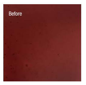
White ceramic tile soiled with dried porcine blood