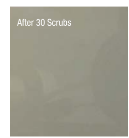
Clorox Healthcare® Hydrogen Peroxide Wipes