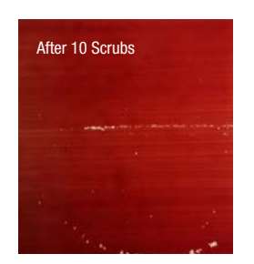
PDI® Super Sani-Cloth® Wipes