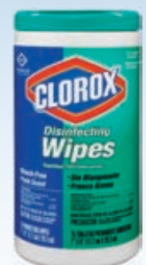
Clorox Commercial Solutions® Clorox® Disinfecting Wipes ▪ EPA-registered to kill 99.99% of illness-causing germs ▪ Unique clear-drying formula case UPC 15949 6/75 ct.