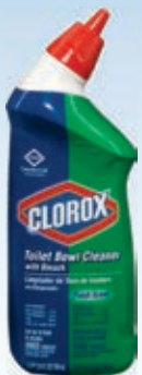
Clorox Commercial Solutions® Clorox® Toilet Bowl Cleaner with Bleach ▪ Disinfects while removing stains to leave bowl sanitary case UPC 00031 12/24 oz.