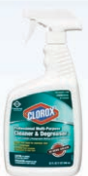
Clorox Commercial Solutions® Clorox® Professional Multi-Purpose Cleaner & Degreaser Spray case UPC 30865 9/32 oz.