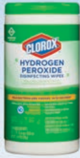
Clorox Commercial Solutions® Clorox® Hydrogen Peroxide Disinfecting Wipes case UPC 30830 6/110 ct.