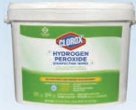
Clorox Commercial Solutions® Clorox® Hydrogen Peroxide Disinfecting Wipes case UPC 30831 2/800 ct.