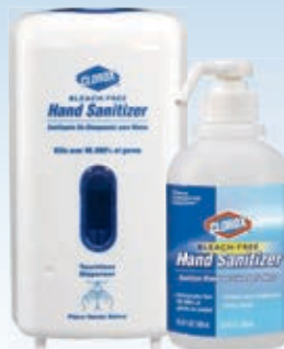
Clorox Commercial Solutions® Clorox® Hand Sanitizer ▪ Kills greater than 99.99% of germs in as few as 15 seconds ▪ Bleach-free case UPC 02176 12/500 ml Spray case UPC 30242 4/1 L Touchless Dispenser