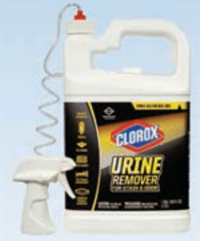
Clorox Commercial Solutions® Clorox® Urine Remover Spray Jug case UPC 31037 4/128 oz.