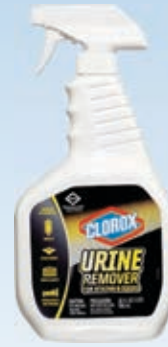
Clorox Commercial Solutions® Clorox® Urine Remover case UPC 31036 9/32 oz.