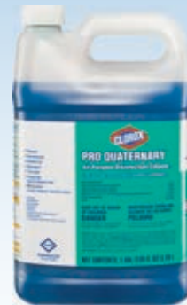
Clorox Commercial Solutions® Clorox® Pro Quaternary All-Purpose Disinfectant Cleaner ▪ EPA-registered to kill 76 microorganisms ▪ pH Neutral case UPC 30423 2/128 oz.