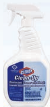
Clorox Commercial Solutions® Clorox® Clean-Up® Disinfectant Cleaner with Bleach, case UPC 35417 9/32 oz.