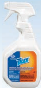
Clorox Commercial Solutions® Tile® Disinfects Instant Mildew Remover ▪ Kills mold and mildew ▪ EPA-registered disinfectant kills staph and athlete's foot fungus case UPC 35600 9/32 oz.