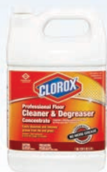
Clorox Commercial Solutions® Clorox® Professional Floor Cleaner & Degreaser Concentrate case UPC 30892 4/128 oz.