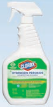
Clorox Commercial Solutions® Clorox® Hydrogen Peroxide Disinfecting Cleaner case UPC 30832 9/32 oz. Spray case UPC 30833 4/128 oz. Refill